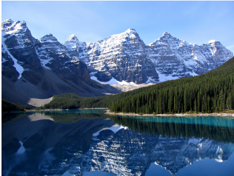
Lake Louise, Alberta